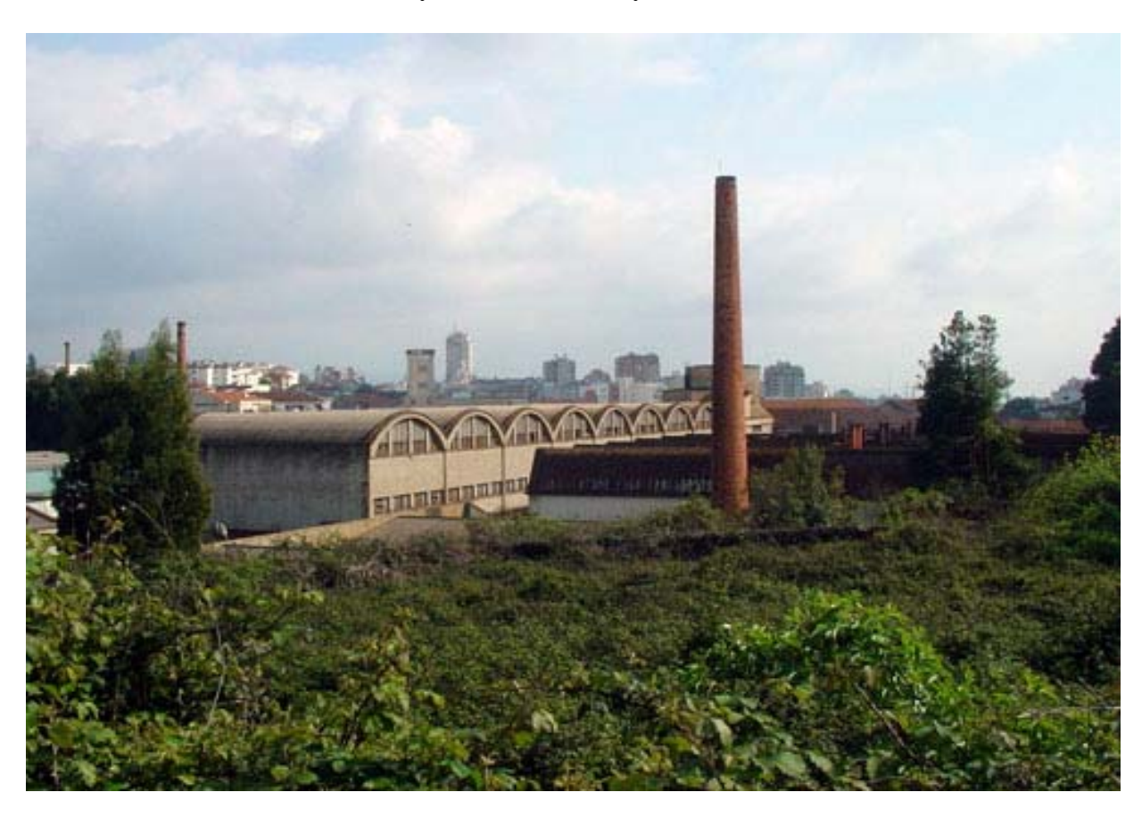
Figure 8 – view NE (see figure 6 to pinpoint this photograph)

- The rural, industrial and urban layers of this territory.